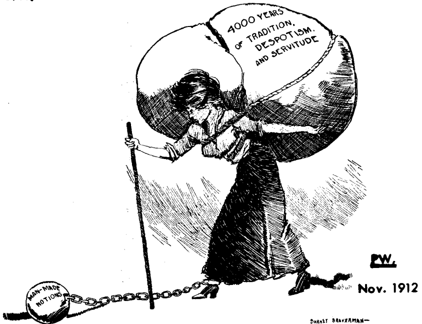
THE BURDEN LONG AGO CALLED "WOMAN'S DUTY."

disavowed free love and the destruction of the family, was feared as a divider of the movement along sex lines. With all the odds against them, the socialist-feminists failed to respond successfully to this plea for a return to traditional socialist agitation on all fronts, and a new wave of 'Male egotism' was evoked which, according to some women, was even more objectionable than the male attitudes dominating the party before 1908.